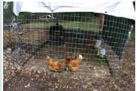
Happy chooks in their new coup.

In the January school holidays, we will be introducing a blue tongue lizard which has been raised by the Ku-ring-gai Council Wildflower Garden."