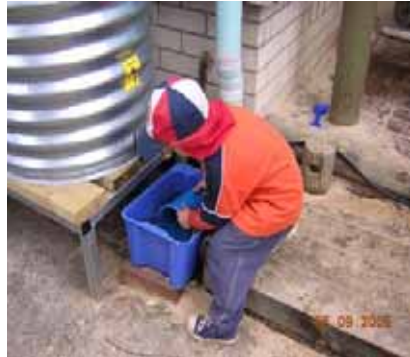
Using the new water tank to get water to use in the sandpit

nity raised the money to install a tank and after shopping around we chose a galvanised tank (which has been custom made for our site).