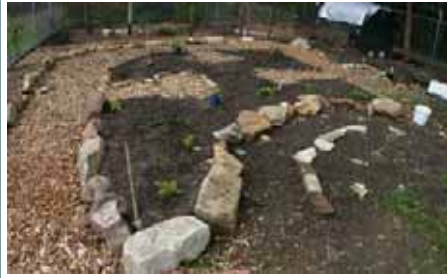
Vegies, herbs and fruit trees

Amanda talking about the project said "Each holiday period the kids embark on a new project for the garden: we have built a pond and planted native trees around this area, we have raised chickens some of whom now live in the garden, built a chicken coup, and recently had a working bee with a group called 'Permaculture